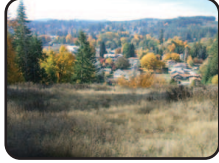
1073 Louisiana Ave. $69,900 RMLS#12504010 Breathtaking view of Vernonia. Build your home with a total of 8 lots. Seller had plans... now it can be all yours to create a home and terraced gardens.