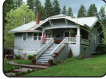
487 Arkansas Ave. $338,900 RMLS#11188819 Gorgeous remodeled 1924 craftsman home w/ fir floors. 5 bdrm, 5 bath plus apartment. Currently a B&B. Covered porch and big deck. 3 blocks from new school.