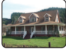
57504 Timber Rd. $399,000 RMLS#12631788 Great farm property in the country with open pasture and barn. 2006 4 bed/3 bath, 2000+ sq. foot home.