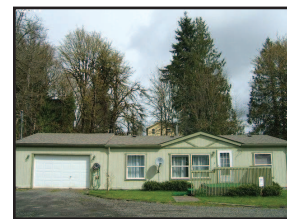
1172 Maple St: Super convenient location near city hall, library, banks and stores. Lots of upgrades in this 3 bdrm, 2 bath dble-wide that features a wood stove, heatpump w/AC, big 1 car garage, dog run, decks, trees and creek. Now just $119,000