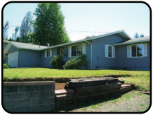
1299 E. Alder $199,500 RMLS#10062418 New paint in & out, nice landscaping, private back yard with new deck. Spacious kitchen w/oak cabinets, walk-in pantry, handy island & utility rm. 4 bdrms, 2 baths, dble-garage on lg lot.

We invite you to come out and see our wonderful country community with natural resources abounding. Lake, streams & trails that will fill every bit of your swimming, fishing, hiking and biking needs.