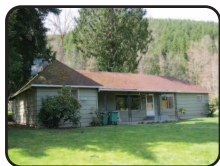
21046 Scappoose-Vernonia Hwy $265,000 RMLS#12397267 Affordable country setting on 13.64 acres with sweeping views of mtns. 1786 sf, 3 bdrm, 2 bath, den/office. Out buildings, 4 bay shop, bring the horse.

Visit Vernonia's Famous SalmonFest, at Hawkins Park 10am-6pm!