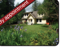
20885 Scappoose Vernonia Hwy $349,975 RMLS#12491373 Beautiful country home on 8.22 acres, fir floors, fir woodwork, wood dbl windows, paved driveway. Claw foot bath, mud room. Oversized 2-car garage, 3-stall shop. So much to show off you must come and see.