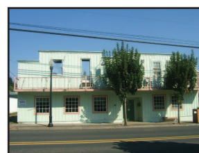
934 Bridge St: In Downtown Vernonia. Formerly a restaurant/lounge w/banquet facilities. Established location on the main street (Hwy 47) through Vernonia. Many possibilities at this great location. Priced to sell plus contract terms. $139,000