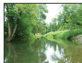
Timber Rd: Private retreat with majestic trees, lush foliage and rambling river. Over 4 1/2 acres of wooded spendor offer years of recreational fun for you and your family. Take your time out here. Just listed at $54,500