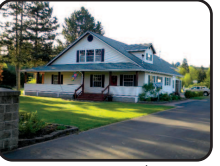
16861 Timber Rd. $595,000 RMLS#12666382 Incredible value! Gorgeous remodeled 4400 sqft home with cherry cabinets, granite & ss. Bonus second legal dwelling & additional bldable lot. Sweet river front for fishing/swimming