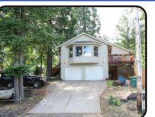
922 Texas Ave. Solid 3 bdrm, 3 bath, contemporary on OA hill above flood plain. Great room w/ gas fireplace, island kitchen w/ gas cooktop, laminate floors, multiple decks, skylights, fenced yard.

Vernonia is located only 50 minutes from Downtown Portland, 35 minutes from Hi-Tech Corridor and we are leading the way with new K-12 school applying for LEED Platinum certification. Come share in our Norman Rockwell lifestyle.