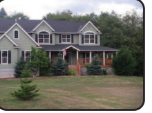
67856 Nehalems Hwy N. $399,000 RMLS#12080603 Southern charmer on 6 acres w/ pond & creek. 4 bdrm, formal living room plus great room, granite countertops, and more.