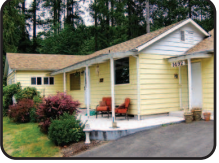
1492 State St. $194,500 RMLS#12662798 Remodeled floor to ceiling in 2006. Very nice updated custom ranch home on 6 city lots. 3 bay shop with a gorgeous view of trees and territory.