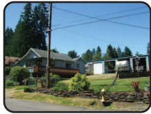
845 Riverside Dr. $139,000 RMLS#12118972 Workshop & 3 bay garage, room for RV's, auto, toys, & tools. Cozy well cared for 2 bdrm bungalow w/covered front porch, rear deck, pantry & gas heat on 1/4 acre lot, completely fenced.