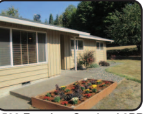
1523 East Ave. Spotless! 3BR on .40ac! Newer kitchen, roof, windows, sliders, furnace, master bth w/ new shwr, int/ext paint! Great Rm, deck, hobby & office. CAT5 Wiring, XTRA Insulation; Heat pump; 2 Gar Shop; RV Prk! 100% financing USDA. $219,900

Look for Vernonia to be featured in the PBS original documentary "Seeking the Greatest Good," a documentary about the Pinchot Institute's focus on Forest Health-Human Health. Read more at www.pinchot.org/gp/FHHH