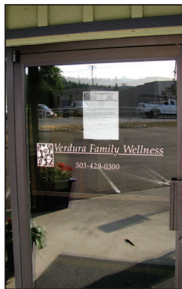
Verdura Family Wellness closed their Vernonia clinic on July 31.