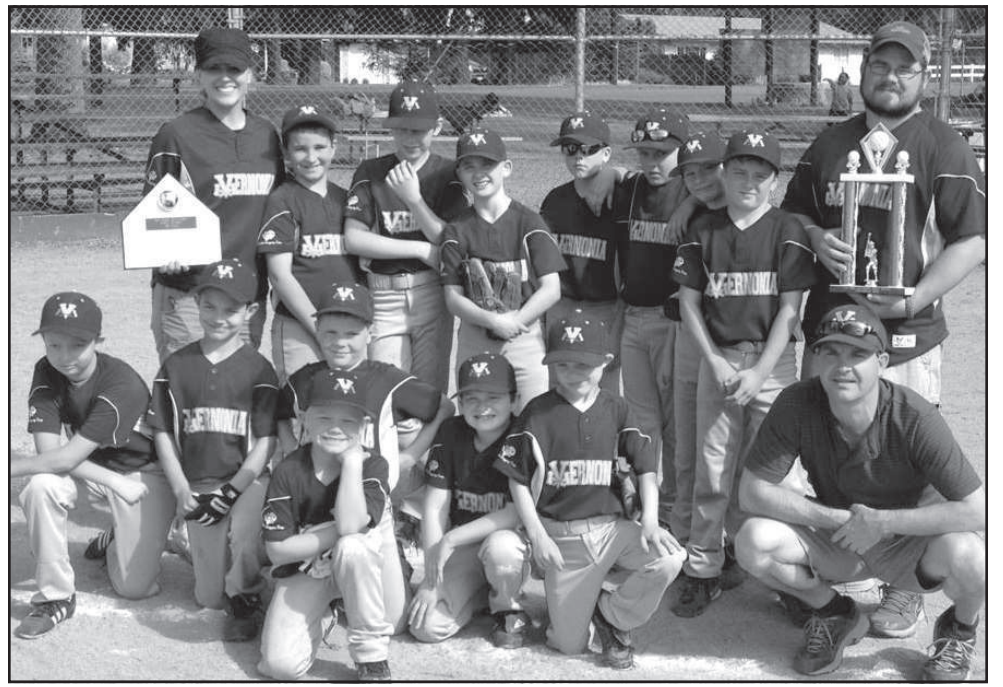
The Vernonia Midgets took 2nd place and won the Sportsmanship Trophy at the 2012 Banks Tournament this season.

Fireworks!!-- Don't forget to stop by and support Junior Baseball at their fireworks stand this year. They will be