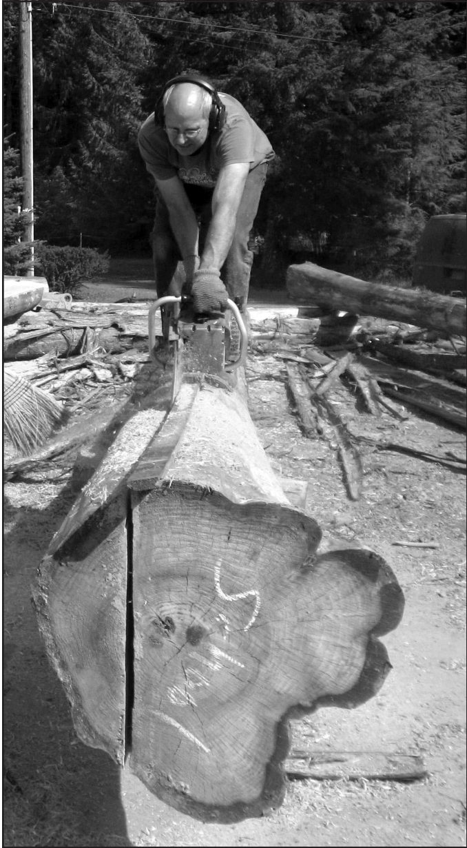
Cory Colburn of Fall Creek Woodworking processes local cedar logs that will be installed in the lobby of the new Vernonia school campus.

Local cedar logs will be used to decorate the lobby of the new Vernonia school building. They will frame a donor wall to highlight the contributions of many individuals, companies and foundations that have made the new building possible.