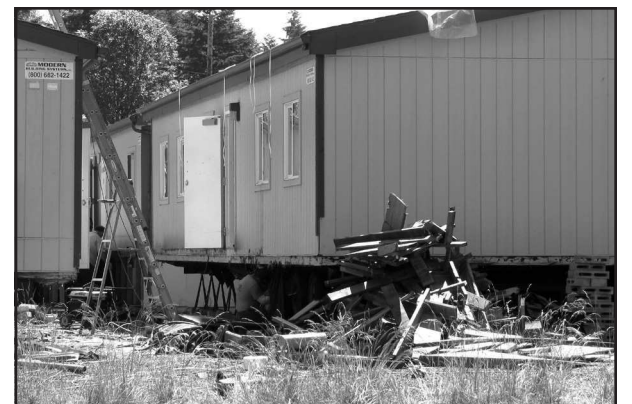
The first modular classrooms were removed from the Vernonia school campus on June 20th. High school and middle school students have attended classes in the mods since 2008.