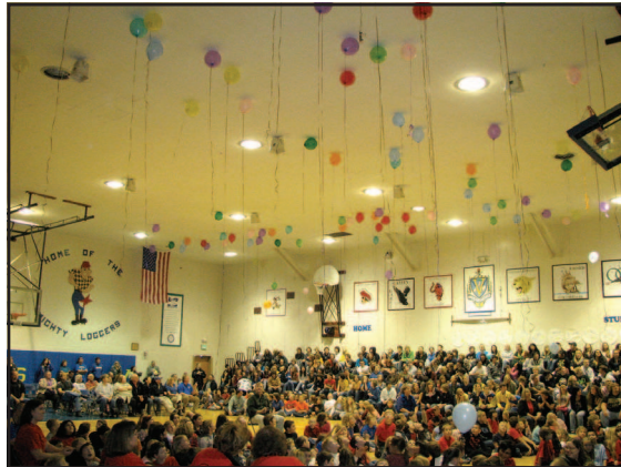
Vernonia students celebrate the passage of the school bond with a rally and balloons.