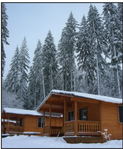
Stub Stewart State Park opened in 2007, 10 miles from Vernonia.