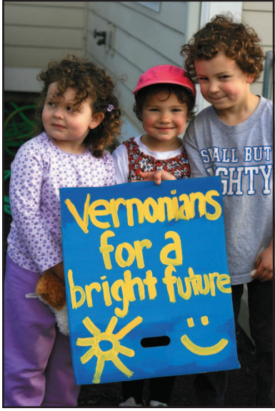
From our first issue in June 2007