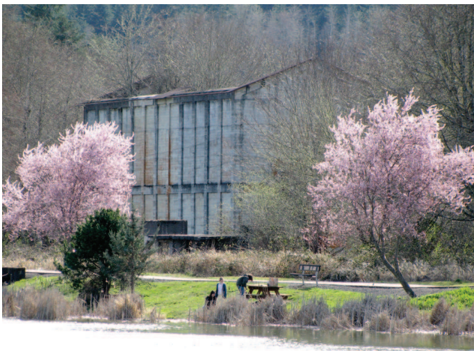
Spring time 2009 at Vernonia Lake.