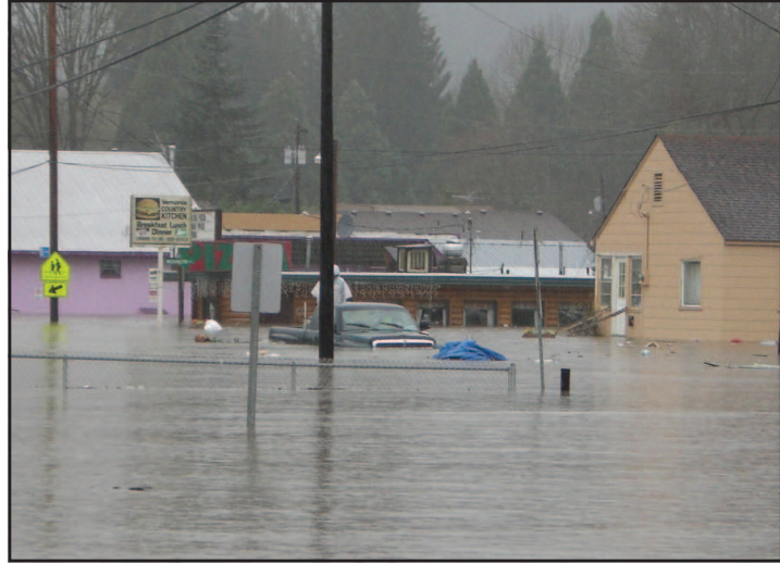
On December 3, 2007 Vernonia and surrounding communities were hit with a devastating flood that impacted residents, local services and flooded all three schools. The community rallied together and with the help of volunteers, worked to rebuild the town.