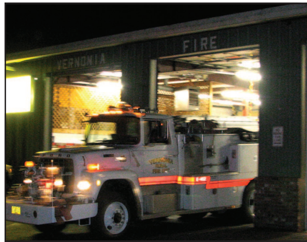
In our March 9, 2010 issue we featured the Vernonia Rural Fire Protection District and their volunteers.