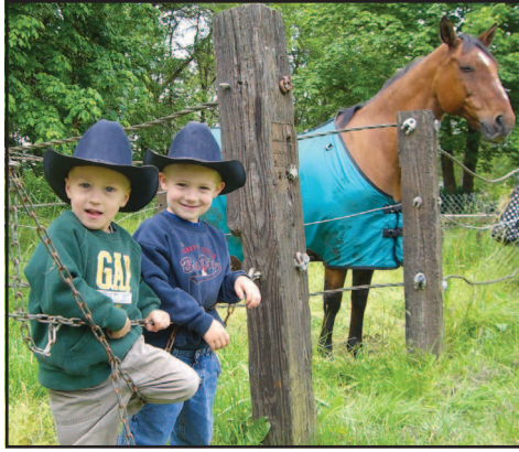
Children are an important part of our community—and they are very photogenic!