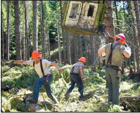
In August of 2008 we spent a day in the woods with a logging crew and learned about logging in the pacific northwest.