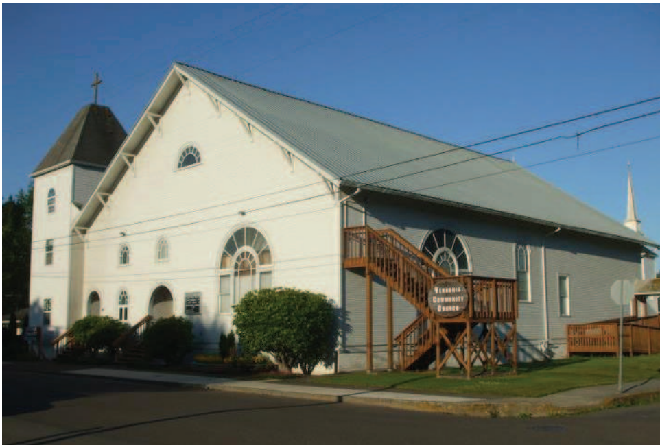
Vernonia Community Church - the new location of Vernonia Summer Meals Program.

If you are hosting a camp, activity, project or just a parent please feel free to contact us. Volunteers are always welcome. We also need groups to host an activity during the summer. Volunteer-