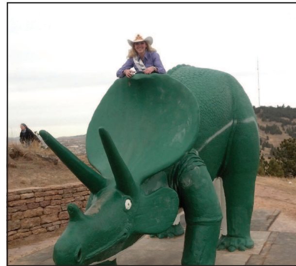
Dinosaur riding at Dinosaur Park South Dakota.