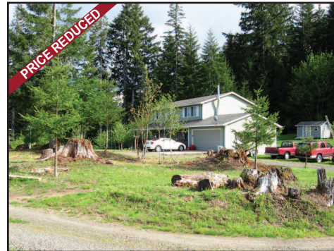
56345 Nehalem Hwy S, Vernonia..... $429,000 Very private 17.44 acre parcel only 10 min to Sunset Hwy. 2496sq.ft., 4bd/2.5ba 2-story home. Experience the lifestyle & stress-free living that the country has to offer!