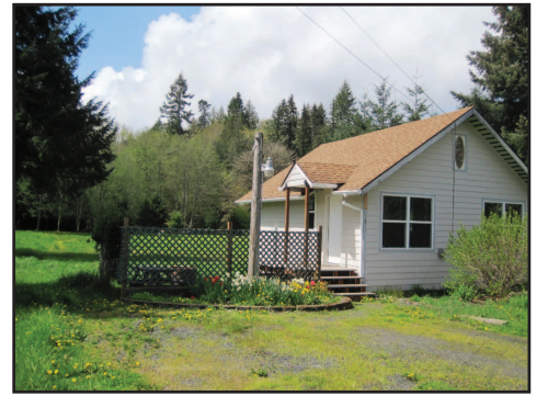
1871 Mist Drive..... $140,000 Simply adorable country 2-story cabin nestled along the Nehalem River, situated on one pristine acre parcel!