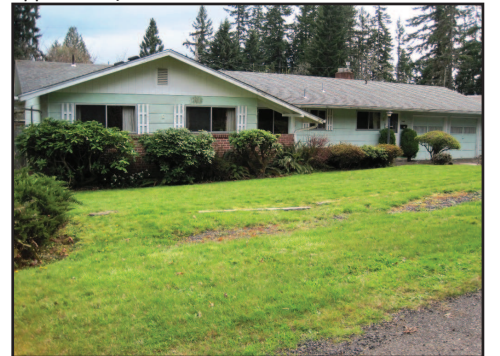
249 E North Street, Vernonia..... $164,750 Comfortable 3bd/2ba, 1400sq.ft. ranch home on 100x100 fenced parcel! Circular floor plan, 2 car oversized garage, move-in ready! Don't miss this one! OUT OF THE FLOOD PLAIN!