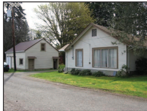
963 Alabama Avenue, Vernonia..... $147,500 2bd/1ba, 1098 sq.ft. ranch home! Other amenities include 25x45 shop, another 2-story shop/garage - all situated on a pristine .38 acre parcel! Out of the flood plain and minutes to new school campus!