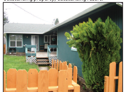
814-816 E. Bridge Street, Vernonia..... $159,950 Duplex. Each unit has a 2bd/1ba, over 740sf., on a .26ac fenced parcel with detached garage. Parking. Well maintained. Minutes to Vernonia Lake. Prime location, out of the flood plain!