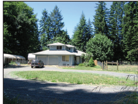
58591 Lone Pine Road, Vernonia..... $227,040 Spectacular country property outside city limits! Situated on fenced 1.35ac, this 1892sq.ft. upgraded, remodeled home has 4bd/2.5ba with gas heat! Call Henk today!