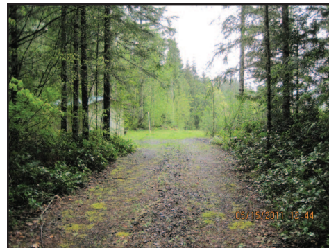
Siedleman Road, Vernonia..... $249,000 Beautiful improved property off McDonald Rd. 16.48 acres w/ well flow 50/gallons a min, cond. use permit in place to build. 10 min to Sunset Hwy! Mature fir trees, great views, mins to Linear Trail.