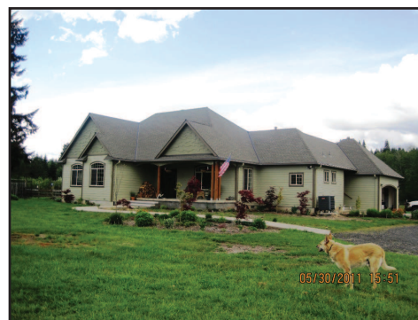
16925 Timber Road, Vernonia..... $599,997 Beautiful craftsman home situated on 5.45 pristine acres! Upgrades galore including granite, tile, white oak hardwoods, skylights, custom cabinets! 25 minutes to the Sunset Corridor!