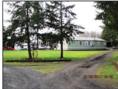
67825 Taylor Lane, Vernonia..... $349,000 Two tax parcels zoned RR5 w/upper end, beautiful "Golden West" triple-wide MFH, barn, 11.74 fenced acres, shop, outbuildings - all the bells & whistles you would want in a country home on acreage!