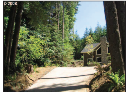
10266 Ridgeview Terrace, Fishhawk Lake Resort.....$229,950 Custom Craftsman with 1832sf of stellar living area with a furniture package! Move-in ready! Outstanding property/outstanding resort!