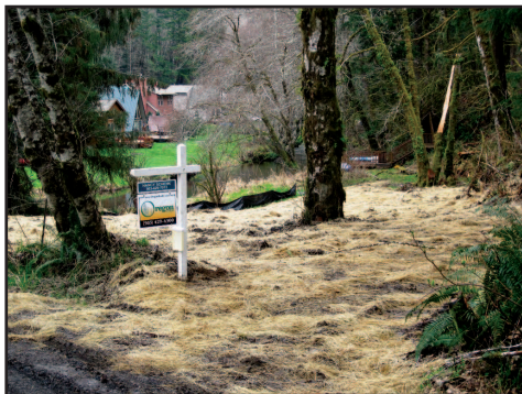
10201 Ridgeview Terrace, Birkenfeld... $14,999 Great bldg lot at the Resort! Easy access from road. Includes clubhouse, water/sewer; swimming, boating, tennis & all the nature & relaxation you can stand! Call Nancy for a brochure today!