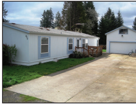
877 Alabama Avenue..... $119,995 BEST PRICED mfh out of the flood plain. 4bd/2ba, 1782 sq.ft. with a 20x22 shop on a .20ac fenced parcel!