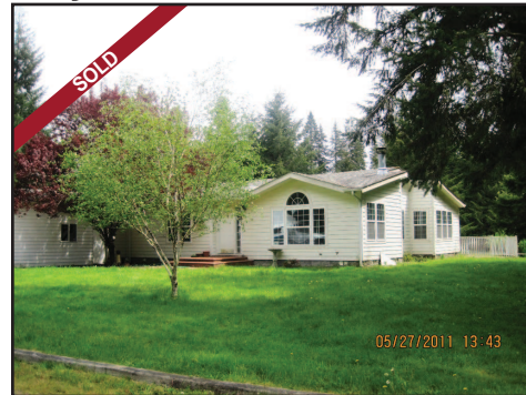
60816 Flack Road, Vernonia.....$219,000 Country estate situated 4 miles from Vernonia, off Keasey Rd. 5 Acres, 2640sf mfh, inground pool, 36x40 shop, 2 horse stalls, air conditioning, skylights - BEST BUY!