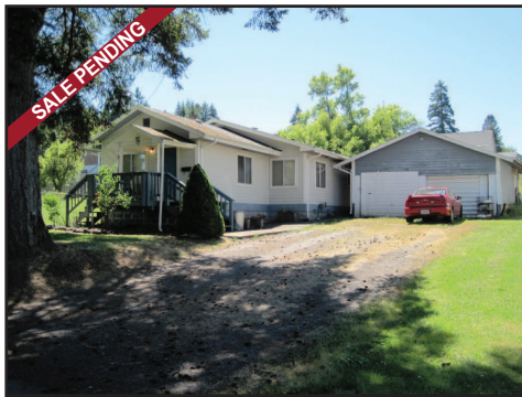
945 3rd Avenue..... $112,000 City & mountain views from this jewel!! .43 acre fenced parcel with a shop, upgraded 955 sq.ft. home & more!