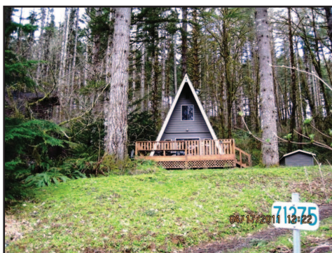
71375 North Shore Drive, Fishhawk Lake Resort.....$179,700 Stellar A-frame is just 24 mi north of Vernonia-the best kept secret in the country! Immaculate & adorable home with a filtered view of the lake!