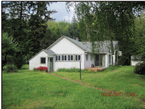
32180 Pittsburg Rd, St. Helens, OR...$399,000 Two legal dwellings on the property, 19.42 acres, 5000sf of outbuildings, 3 water sources, pasture, shop, barn, orchard, trees - it is a BEST BUY! Call Nancy for brochure!