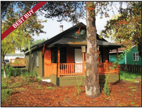
1107 Ruth Avenue..... $79,900 BEST PRICED restored stickbuilt home out of the flood plain. Low property taxes! 3bd/2ba, 1192sq.ft!