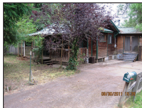
209 "C" Street..... $54,950 JUST LISTED! 2bd/1.1 baths, family room & formal dining room, 1156 sq.ft. situated on .25 partially fenced acres!