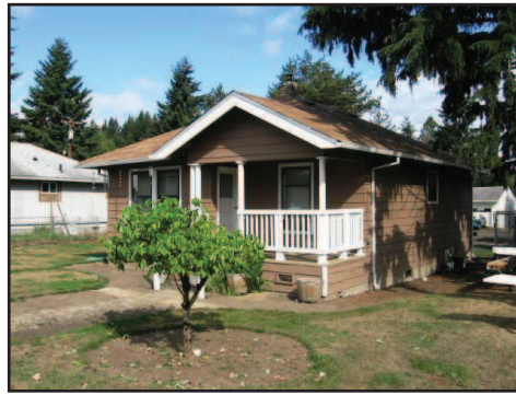
654 E. Bridge Street..... $119,750 Lease Option possible...on this cute 2bd/1ba bungalow on an oversized lot with outbuildings. RV parking too!