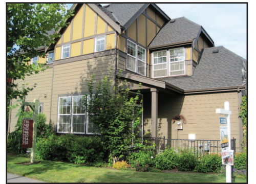
736 NE 72nd Ave, Hillsboro, OR..... $219,900 You will fall in love with this end unit! Very tastefully done w/upgrades galore! 1647 sq.ft., 3bd/2.5ba in Orenco Station! Short sale has been approved by bank.