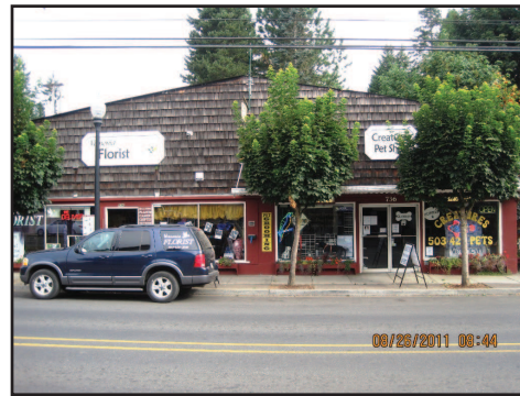
736 Bridge Street..... $277,000 Fabulous opportunity to live & work under the same roof. 5940 sq.ft., two retail spaces, full living quarters, newer roof, electrical & plumbing! Prime location!