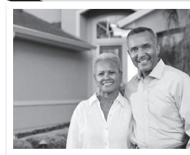
the "you and me at last" home

The perfect mortgage from US will make you feel right at home.