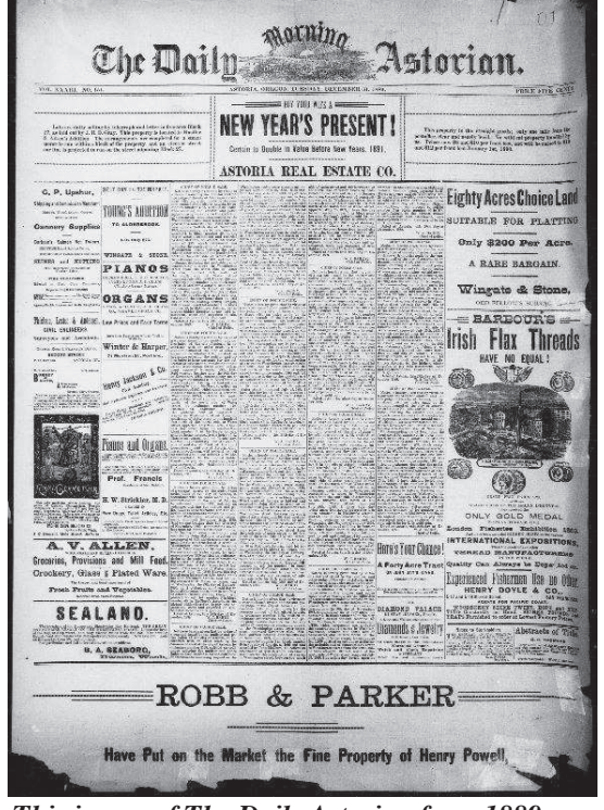
This image of The Daily Astorian from 1889 can be found at http://oregonnews.uoregon.edu.

While microfilm continues to be the preservation and archival medium of choice for newspapers,