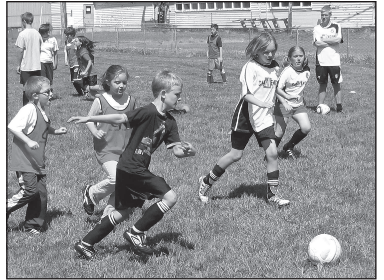
Players scrimmage during the recent Challenger Soccer Camp hosted by the Vernonia Soccer Club.

For both the young English coaches, the Challenger camps are a fun