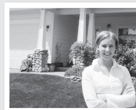
the “I can’t believe it’s mine” home

Cedar Ridge Sponsor Swim Lessons 8210 SW Tygh Loop Tualatin, OR 97062