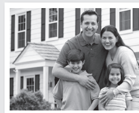
the “make room for more” home