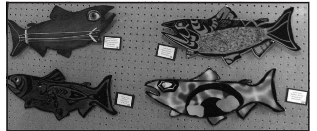
Jr. Salmon like these are looking for a home. You can adopt one at the June 3rd First Friday.