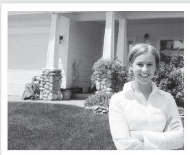
the "I can't believe it's mine" home

Vernonia's Voice is published twice each month on the 2nd and 4th Tuesday. Look for our next issue on June 14th.