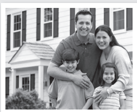
the "make room for more" home