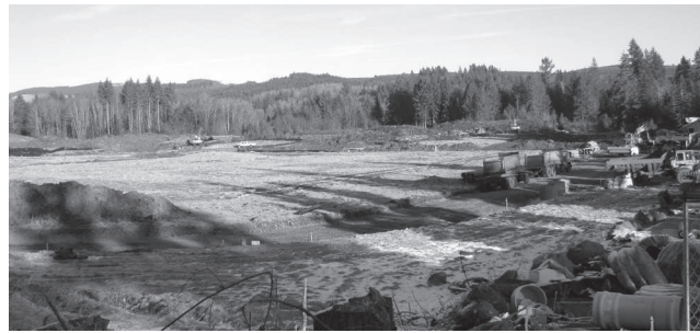
The school construction site in Vernonia on January 3, 2011.