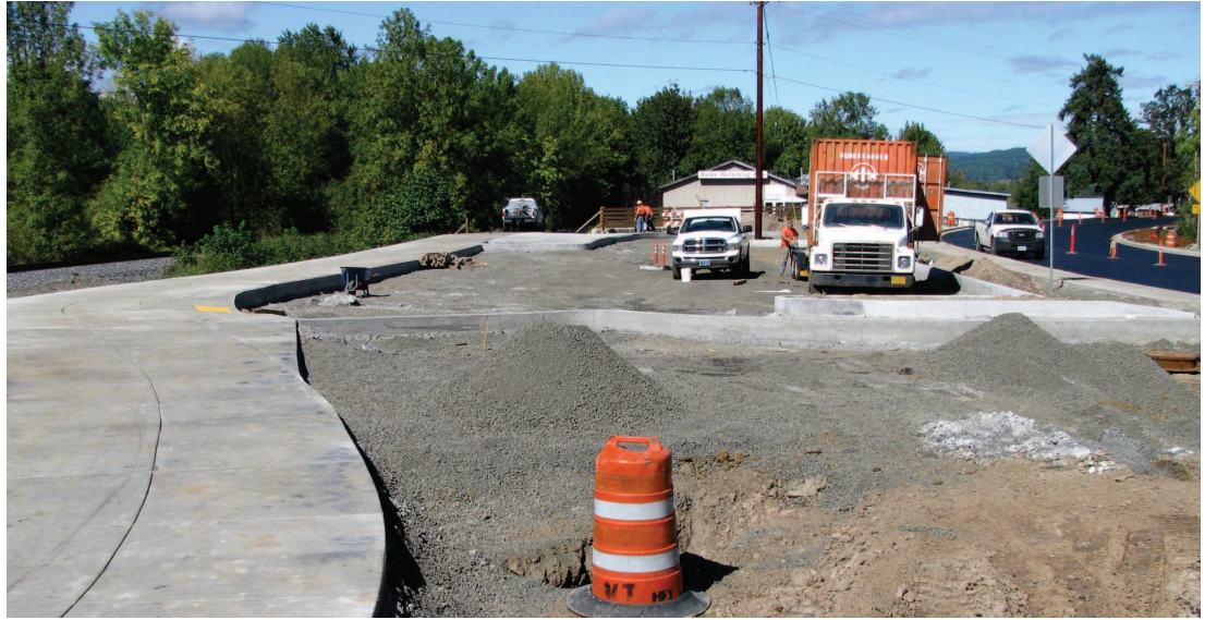
The new trailhead for the Banks Vernonia Linear Trail was under construction in late September. A Grand Opening is scheduled for October 29 to celebrate the completion of the trail all the way into the City of Banks.

Lucas said staff is doing some other work at some of the trailheads. "We're trying to get it looking its best for the Grand Opening," said Lucas.