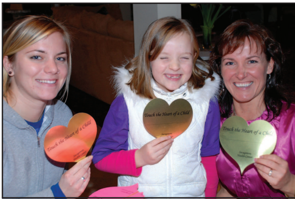
Touch the Heart of a Child raises money for the Sacagawea Health Center in St. Helens