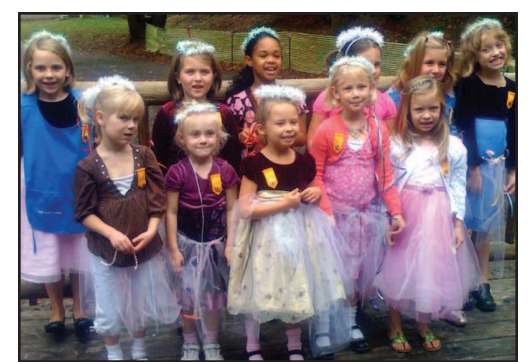
The Daisy Girl Scouts got dressed up for a Tea Party.

"My son was going to be finished with Cub Scouts and I had been involved with that for four years and I didn't want to move on to Boy Scouts with him," said