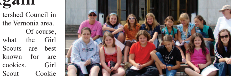
The Juniors and Cadettes visited Salem (above) and went camping (below).

Recent service projects Vernonia Girl Scouts have completed include: making blankets and delivering them to sick babies and young children at Emmanuel Hospital; making dog and cat toys and delivering them the Columbia County Humane Society shelter in St. Helens; visited and organized activities with senior citizens at the Jennings McCall Assisted Living Center in Forest Grove; and tree plantings with the Upper Nehalem Wa-