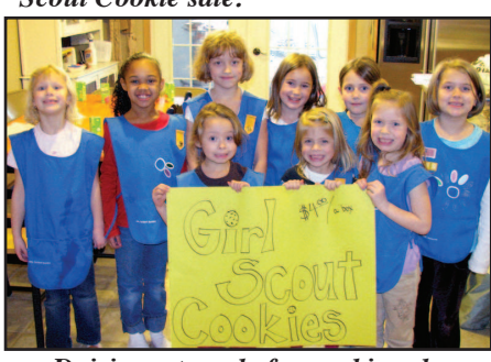
The Cadettes hard at work on posters for the upcoming Girl Scout Cookie sale.