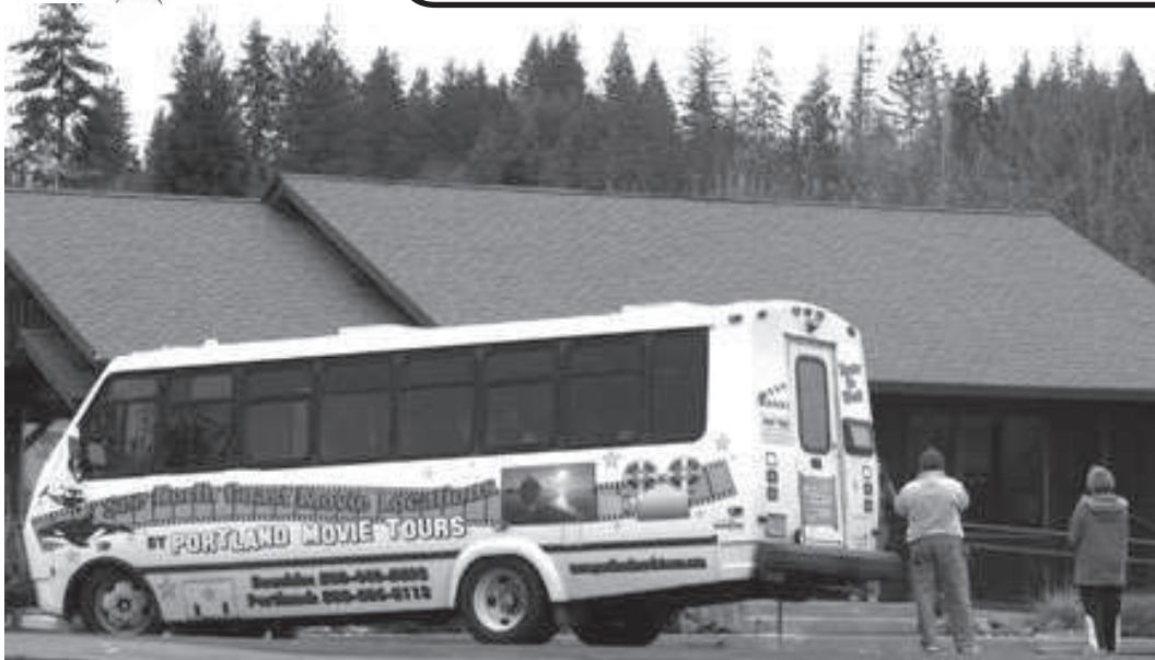
The new Twilight Movie-New Moon was released in November, spurring a host of fans to visit Columbia County, home of numerous film sites from the first film in the series. Here fans visit the “Forks, Washington Police Station,” aka the Wauna Federal Credit Union, Vernonia branch.