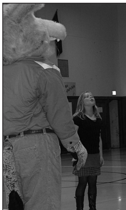
Showing off a Timberwolf Howl!