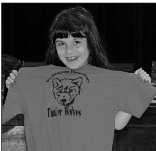
A New Mascot and new School colors, red and black, for WGS!

The students celebrated the rest of Spirit Week by enjoying "Crazy Hat Day," "Crazy Hair Day," "Hippie Day" and "Pajama Day."