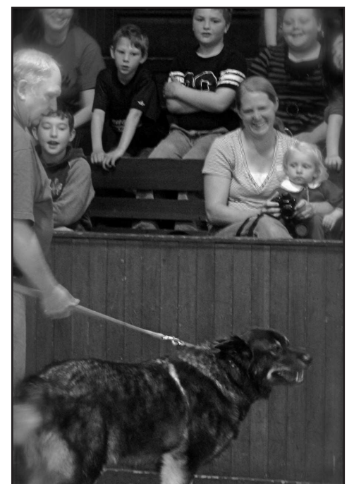
A real Timberwolf visits Washington Grade School to help celebrate the school new mascot name, "The Timberwolves"