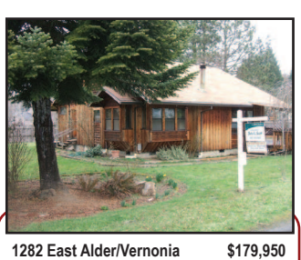
3 bedroom/2 bath. Oversized Yard!