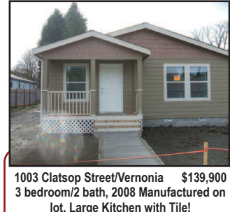
lot. Large Kitchen with Tile!