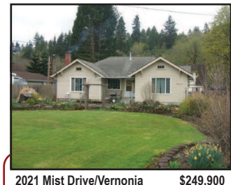
1.4 acres with river frontage. 3 bedroom/2 bath. GREAT BACK YARD!