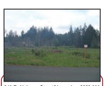
840 E. Alabama Street/Vernonia $252,000 ONE FULL ACRE! 3 bedroom/2 bath, 2112 sq. feet.