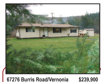
2.38 acres with shop & barn! Nice 3 bedroom/1 bath home. A GREAT BUY!