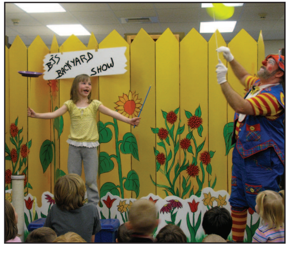
entertaining the kids at the Vernonia Library (above).

Kids and adults alike enjoyed celebrating Mayday with a Maypole Dance at Hawkins Park (above left). It was part of Ver-nonia First Friday's which