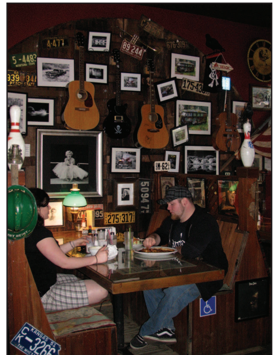
Cafe 47 is now serving breakfast

Vernonians have some new choices for meals with some more changes on the horizon. Things are looking, and tasting, pretty good around here.