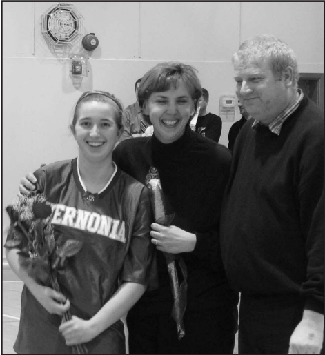
Vernonia Basketball honored their seniors and their families at the last game of the season (above).

The Winter Sports Desert Banquet will be held on March 11th.