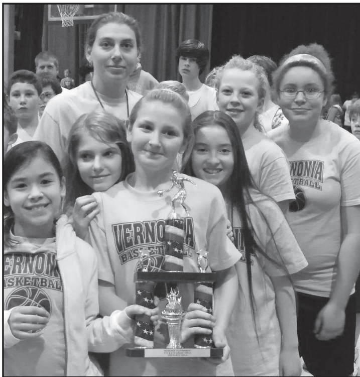
The Vernonia 5th and 6th grade girls show off their 3rd place trophy from the First Annual Vernonia Youth Basketball Tournament, which featured teams from Astoria, Warrenton, Seaside and Vernonia.

The tournament was the first opportunity for the Vernonia youth players to play in front of a home crowd, as they have been playing as part of a league in Forest Grove, and have had to travel each week to compete.