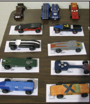
Some of the entries in this years Cub Scout Pinewood Derby (above).