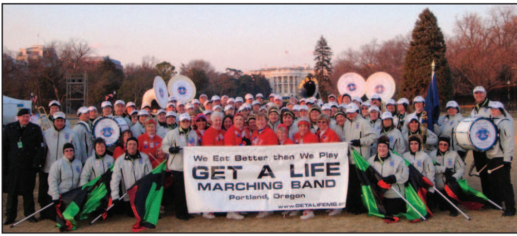
The "Get A Life Marching Band" went to Washington DC and performed in the Inaugural Parade. Here they are in front of the White House