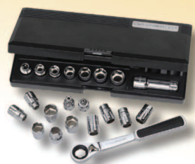
21-Pc. GearRatchet Combo Socket Set w/ Case #8921