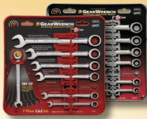
SAE or Metric 7-Pc. GearWrench Combination Tool Set (SAE) #9317 (Metric) #9417