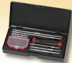
39-Pc. GearDriver Ratcheting Tool Set w/ Case #8939