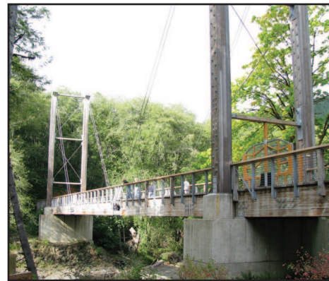
The Suspension Bridge

For an educational experience that will feel more like an adventure, try a short drive to the Tillamook Forest Center.