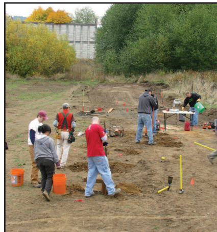
Volunteers start work on the Skills Area (above); A Technical Trail Feature is partially complete (left).