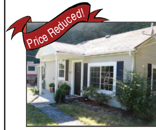
91948 Taylorville Road, Westport. $129.900 Totally remodeled w/new kitchen, bath with etted tub, windows, carpet, tile - the works! Minutes to WAUNA Paper Mill & Clatskanie! New septic, community water under $20/month and the best priced electric rates on the west coast! All on .64 Acre parcel! www.91948TaylorvilleRd.com

10266 Ridge Way Terrace......$275,000 Fishhawk Lake, a scenic recreational paradise You will fall in love with this custom built 3BD/3BA chalet with vaulted ceilings, bonus room, upgraded kitchen w/granite & custom cabinets, nardwood floors. Log on for more information! This home will be open every Sunday through September! So treat yourself & come visit Fishhawk Lake www.10266RidgeviewTerrace.com