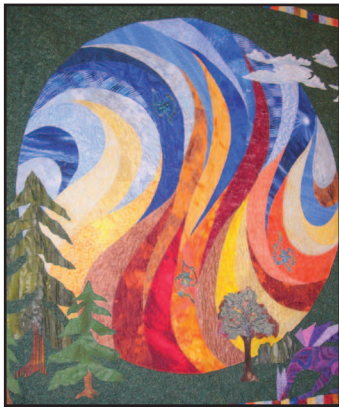
Beautiful quilt work is a highlight of the County Fair exhibits (right).