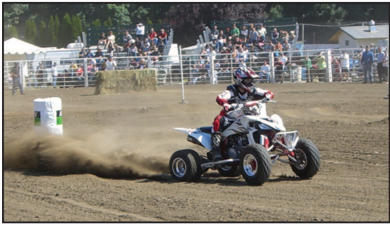
The ATV Rodeo is a new and popular event (above).

This year's Columbia County Fair was full of fun and surprises. From great hand made crafts to 4-H kids winning ribbons there was something for everyone.