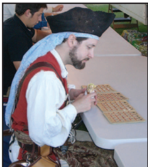
A pirate takes a break and relaxes with some bingo (above).