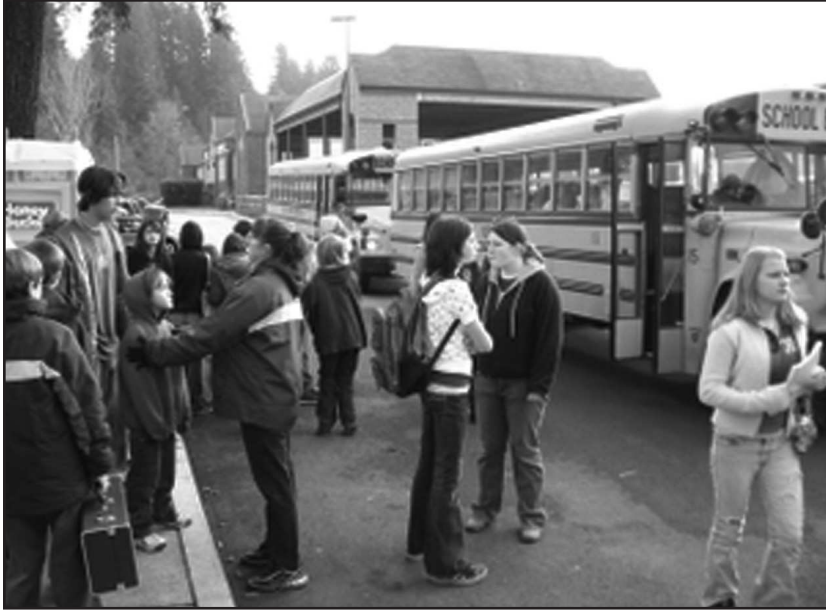
Students waiting bus travel to Scappoose

In what some parents considered a controversial decision, the Vernonia School Board worked out a plan with the Scappoose School District to share facilities for nine days until the school Christmas break, allowing Vernonia's students to return to classes and studies only eight days after the Flood of 2007.