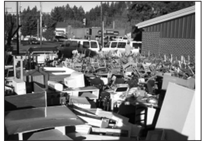
Salvaged school desks, chairs and furniture fill parking lot.