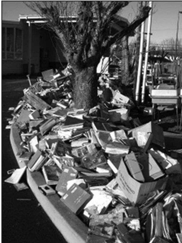
A sea of text books lines VHS driveway

Our students are eager and willing to help our community.