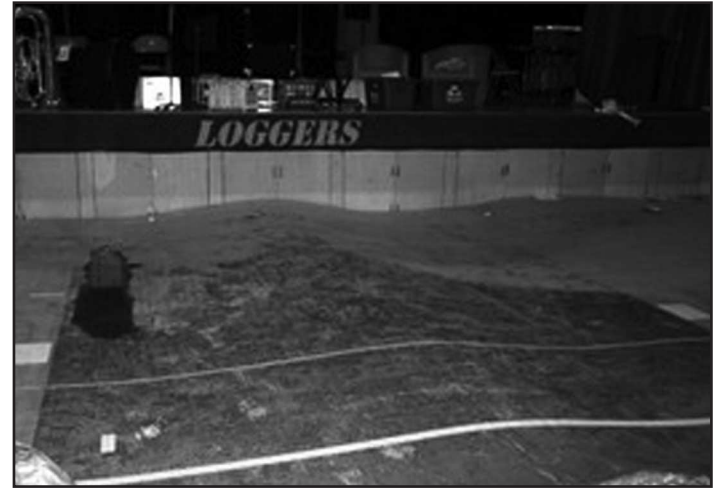
VHS gym floor a wave of hardwood