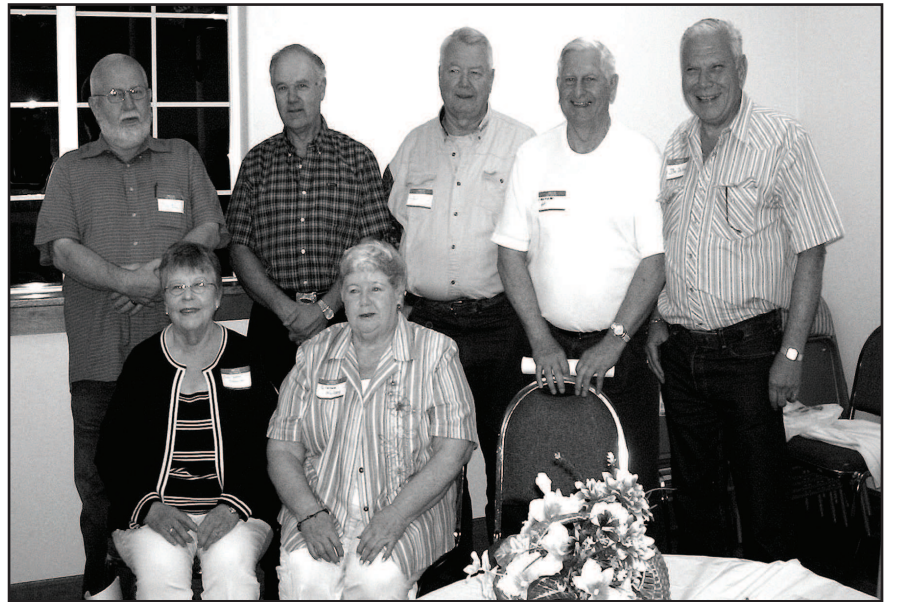
Class of 1961

The planning committee for this event is often asked why they don't have a combined gathering for "all" of the graduates of Vernonia High School. It seems as though many of the younger generations are turned away by the terms "Old Timer's Picnic" or "Old Grads" as it has become known. However, the organizers want all grads to know this annual event is for everyone that ever attended school or lived in Vernonia, and their families. Younger folks are urged to attend. The picnic is always held on the 3rd Sunday in August, so mark your calendars now.