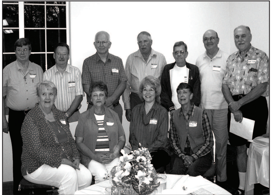
Class of 1960