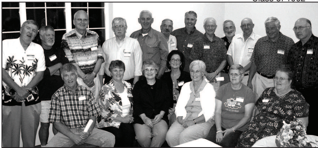
Class of 1962