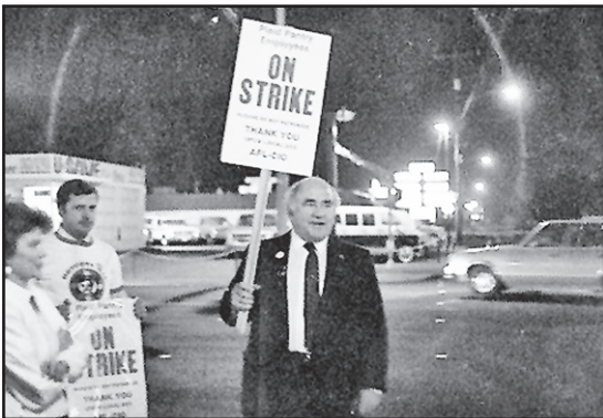
Screen Actors Guild president Ed Asner walks 1986 Plaid Pantry picket line in Salem with members of UFCW Local 555.