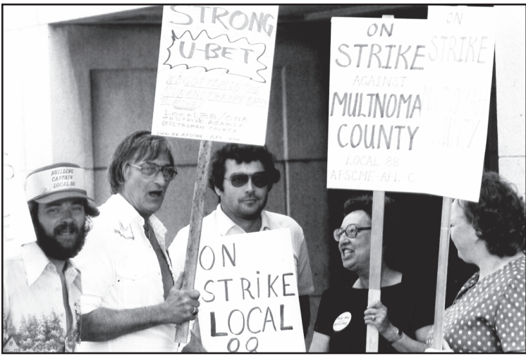
A 1980 strike by Multnomah County Employees Local 88 lasted 38 days.