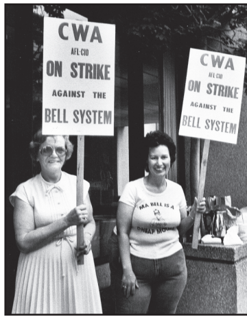
CWA members picket Pacific Northwest Bell in August 1983 as part of nationwide strike at Ma Bell.