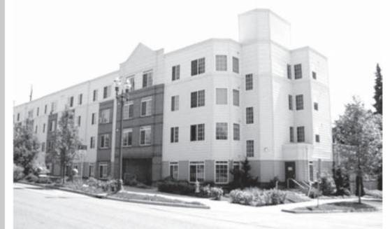
KIRKLAND UNION PLAZA Opened in March of 2002