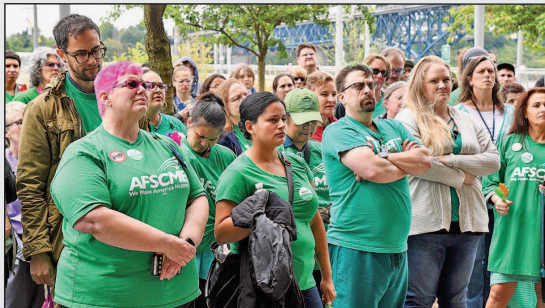
GREENING OUT THE OHSU BOARD. More than 100 members and supporters of AFSCME Local 328 marched into the June 27 meeting of the Oregon Health and Science University (OHSU) board of directors. They were there to show their opposition to concessions in contract negotiations. The board wouldn’t give them an opportunity to deliver a statement, so they sat in silent protest, then walked out when OHSU’s chief financial officer got up to speak. He reported that OHSU’s operating income was “well above budget” at $140 million, with earnings at $56 million above budget. At the bargaining table, OHSU is proposing meager raises, takeaways on health insurance, and a new paid-time-off policy that would incentivize employees to work while sick.