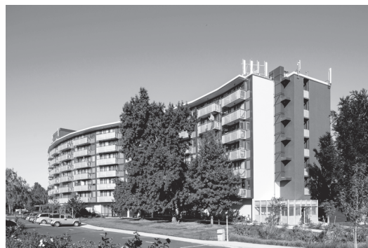
WESTMORELAND'S UNION MANOR Opened in October of 1966