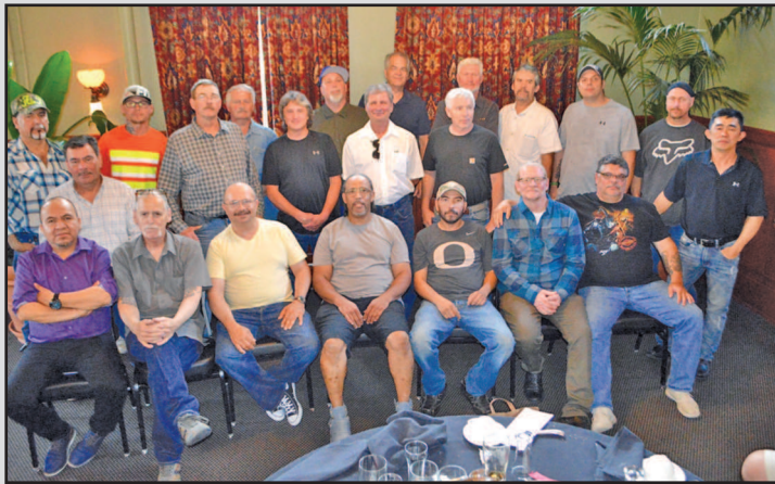
The following members of Local 10 (pictured above left) received bonus checks of $400, $700, or $1,000 depending on the number of class requirements they met, plus a Makita bluetooth speaker and a monogrammed Lucas ProFinish paint brush.

The STAR program was initiated in 2004 when Painters and Allied Trades District Council No. 5 and the Signatory Painting Contractors Organization made a commitment to each other to field the best-trained workforce in the industry. This led to the creation of the Painters Union/Management Partnership, or PUMP. The program is funded by a cents-per-hour contribution negotiated in their collective bargaining agreement. Local 1236 started funding its program in 2010.