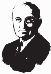
Harry S. Truman

"The right to join a union of one's choice is unquestioned today, and is sanctioned and protected by law."