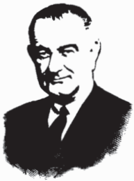
Lyndon B. Johnson

"The AFL-CIO has done more good for more people than any other group in America in its legislative efforts ..."