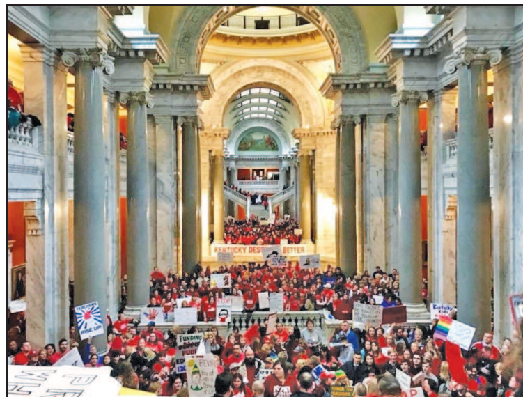
CAN YOU HEAR US NOW? Teachers completely filled the Kentucky Capitol building April 2, furious about a law cutting their retirement benefits.

The West Virginia teacher strike started when the state Leg-