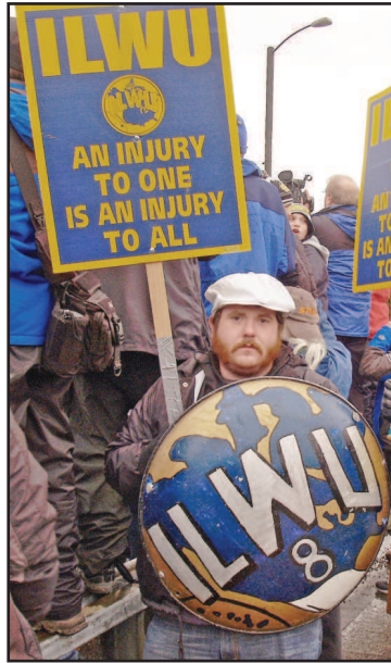
THE UNION IS MY SWORD AND SHIELD: West Coast longshore workers make $42 an hour not because of employer generosity but because over the years they have fought tenaciously through their union to maintain their way of life.

The agreement contains no concessions by the union. It raises wages, increases employer pension contributions, and maintains existing health benefits. Neither the union nor