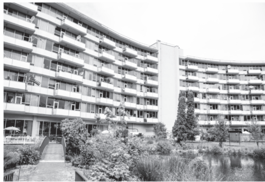
WESTMORELAND'S UNION MANOR Opened in October of 1966