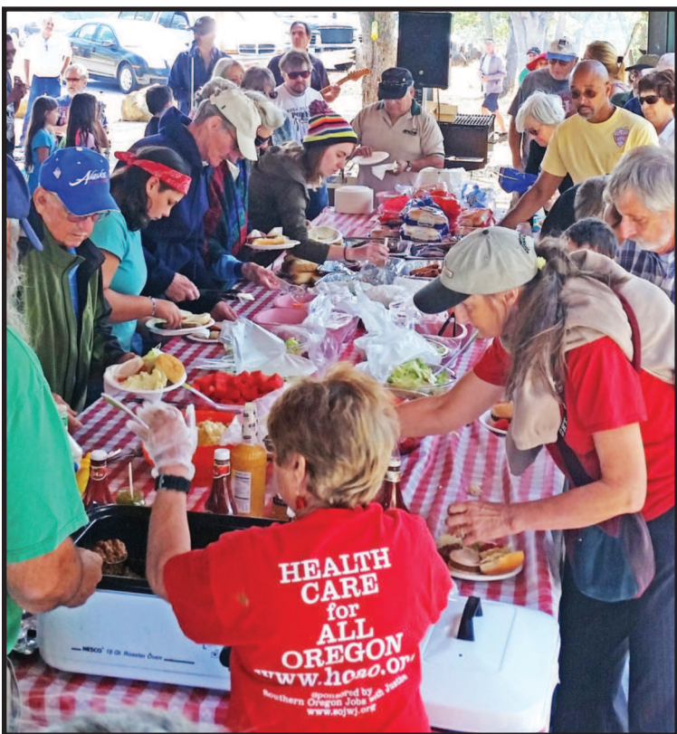
The Southern Oregon Central Labor Chapter Labor Day picnic attracted a festive crowd of nearly 175 to Emigrant Lake in Ashland.