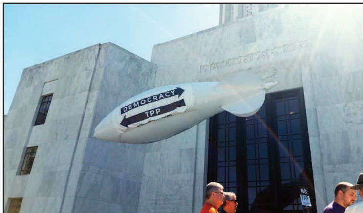
ANTI-TPP BLIMP IN SALEM: Members of the United Steelworkers Legislative Committee fly a 25-foot protest blimp over the State Capitol Aug. 23 to denounce Oregon Gov. Kate Brown's support of the Trans-Pacific Partnership.

"I'm disappointed by Governor Brown's support of the Trans-Pacific Partnership," said