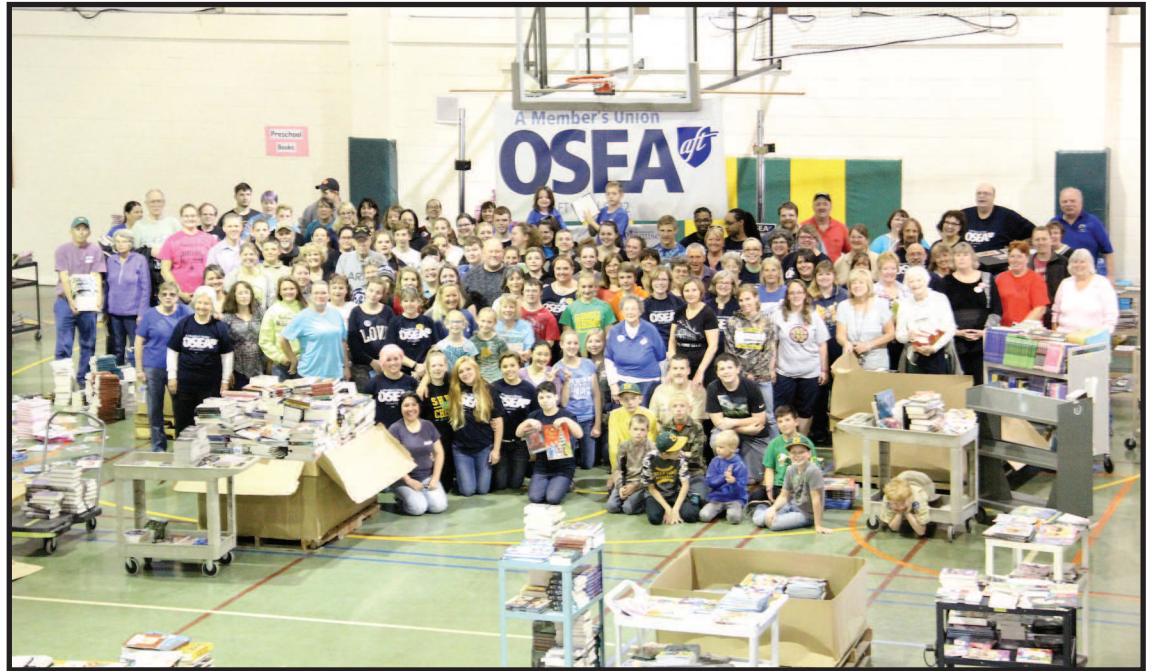
ABOVE: In the Sweet Home High School gym, about 200 volunteers take a break from sorting 40,000 books.

Since originally partnering with First Book in 2012, OSEA members have been able to get roughly 150,000 free, new books into the hands of low-income children. Of that total, more than 80,000 books were delivered this year to children in Sweet Home, Beaverton, and Woodburn. And there's more to come. OSEA members in Southern Oregon are working on two more First Book registration drives and hope to deliver an additional 80,000 books to kids in their communities later this year.