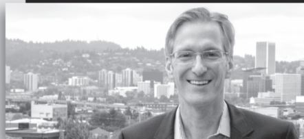
PAID FOR BY FRIENDS OF TED WHEELER