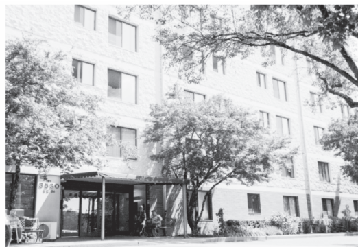
KIRKLAND UNION MANORS I, II, III Opened in 1980, 1985 & 1995