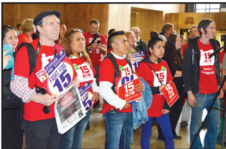
Supporters of the group 15 Now hold an impromptu rally in the Oregon Capitol rotunda April 13 before a joint House-Senate committee hearing on raising the minimum wage.