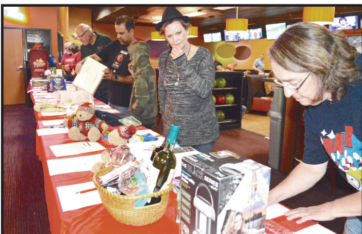
A portion of the money is raised from a silent auction. Items are donated. Here, participants look over the goodies.