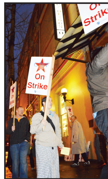
Supporters of striking University of Oregon grad students picket Dec. 9 outside UO's Portland branch campus.

The strike threw plans for final exams into chaos. Grad students teach about a third of classes at UO, and in classes taught by professors, they lead discussion groups, run labs, and proctor exams. The UO administration tried to get academics and others to do the work of strikers, with mixed results.