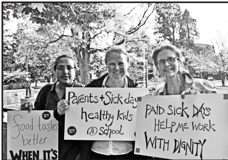
Supporters of paid sick leave turn up April 28 to thank Eugene City Council for moving forward on a City ordinance.

On April 28, about 40 Eugene residents turned out to City Council for what she described as a “show of gratitude.” One worker told City Council about his experience recovering from surgery without the help of his wife, who had no paid sick days. Behind him stood eight activists holding petitions from each of the eight City Council wards. The petitions, signed by over 3,200 Eugeniens, were gathered in a door-to-door canvass by Oregon Working Families Party.