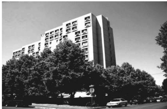
MARSHALL UNION MANOR Opened in January of 1974

Marshall Union Manor 2020 NW Northrup Portland 97209 503-225-0677