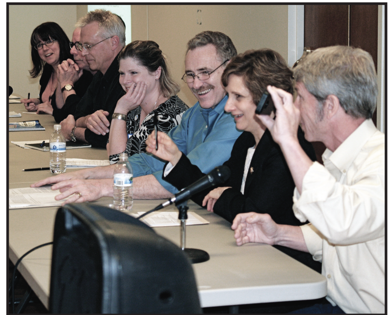
U.S. Rep. Kurt Schrader (right) tells the audience that he is using his smartphone to take notes of their concerns about sequestration. Joining him at the AFL-CIO-sponsored "sit-in" was U.S. Rep. Suzanne Bonamici.

The agency, which serves 15,000 low-income families, has seen demand