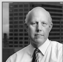
Nelson Hall • Personal Injury • Workers Compensation